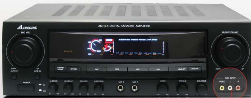
Front AUX Inputs