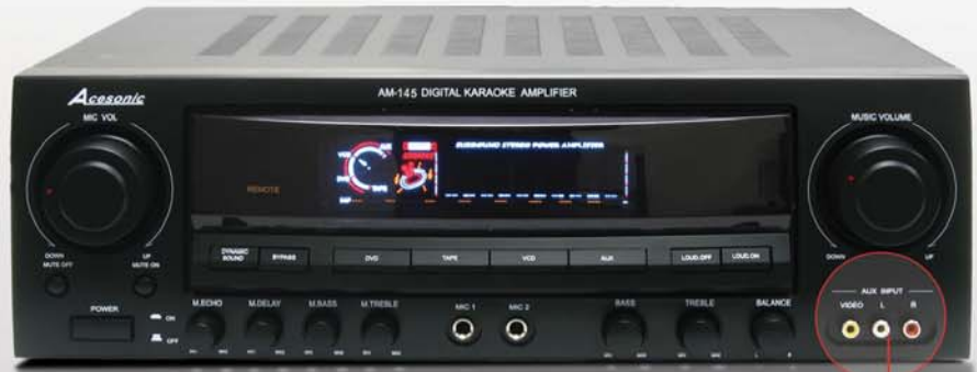
Front AUX Inputs